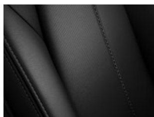
Leather, Black Roadster GT, RF Limited