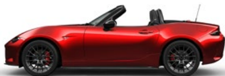
Soul Red Crystal Metallic (46V)