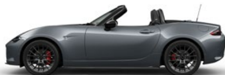
Polymetal Grey Metallic (47C)