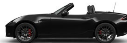
Jet Black Mica (41W)