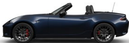
Deep Crystal Blue Mica (42M)