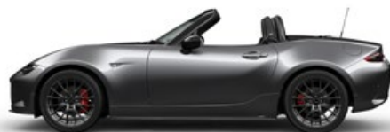
Machine Grey Metallic (46G)