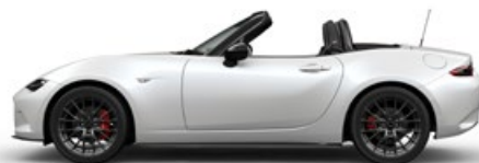
Snowflake White Pearl Mica (25D)