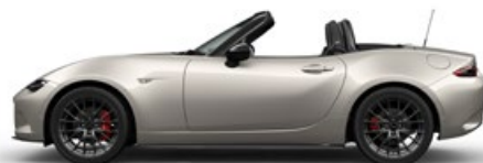
Platinum Quartz Metallic (47S)