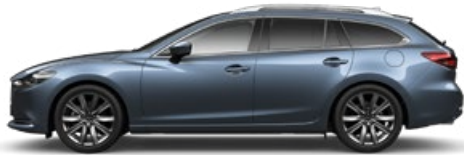
Blue Reflex Mica (42B)