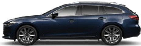
Deep Crystal Blue Mica (42M)