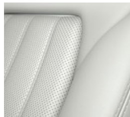
Nappa Leather, Pure White Takami (Opt.)