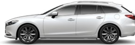
Snowflake White Pearl Mica (25D)