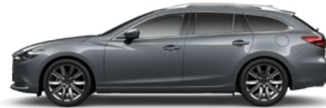
Polymetal Grey Metallic (47C)