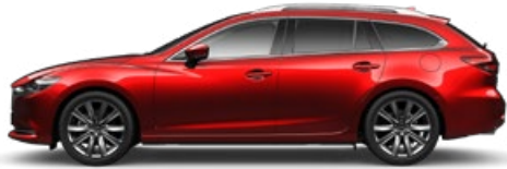
Soul Red Crystal Metallic (46V)