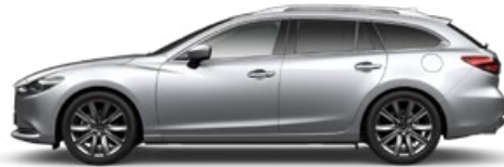
Sonic Silver Metallic (45P)