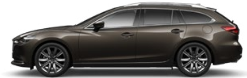
Titanium Flash Mica (42S)