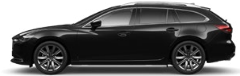
Jet Black Mica (41W)