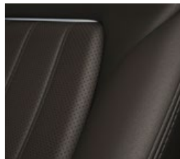
Nappa Leather, Walnut Brown Takami