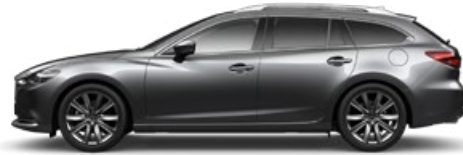
Machine Grey Metallic (46G)