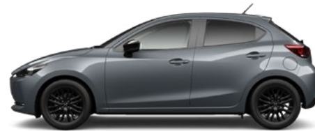
Polymetal Grey Metallic (47C)