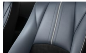
Leather, Blue-Grey with Grand Luxe Suede, Black Limited