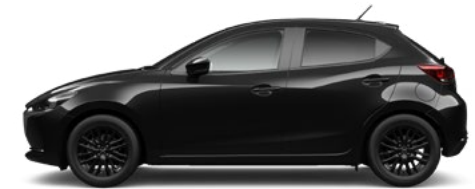
Jet Black Mica (41W)