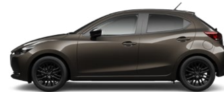
Titanium Flash Mica (42S)