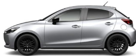
Sonic Silver Metallic (45P)