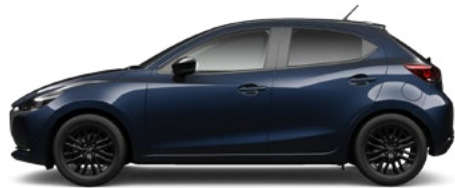
Deep Crystal Blue Mica (42M)