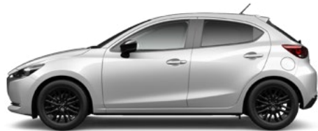
Ceramic Metallic (47A)