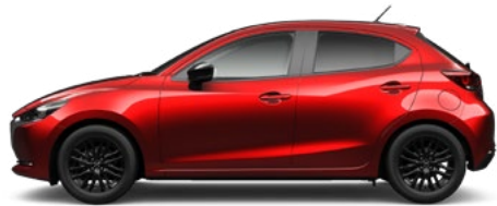
Soul Red Crystal Metallic (46V)