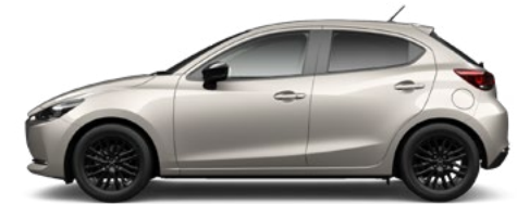
Platinum Quartz Metallic (47S)