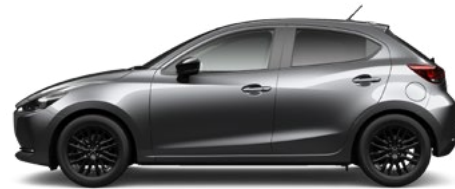
Machine Grey Metallic (46G)