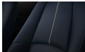
Cloth, Black / Navy GSX