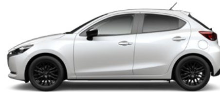
Snowflake White Pearl Mica (25D)