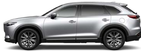
Sonic Silver Metallic (45P)