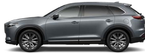
Polymetal Grey Metallic (47C)