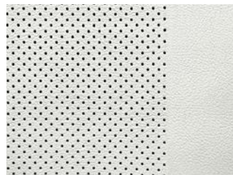
Nappa Leather, Pure White Takami (Opt.)