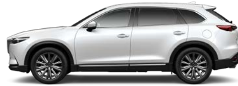
Snowflake White Pearl Mica (25D)