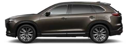
Titanium Flash Mica (42S)