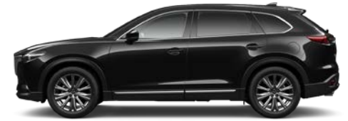
Jet Black Mica (41W)