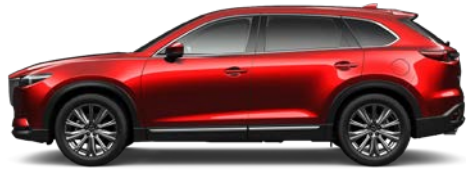
Soul Red Crystal Metallic (46V)