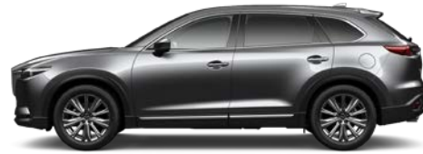
Machine Grey Metallic (46G)