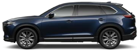
Deep Crystal Blue Mica (42M)