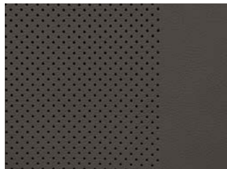
Nappa Leather, Walnut Brown Takami