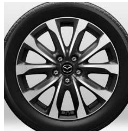
18-inch Machined Alloy Wheel (GSX, GSX Leather)