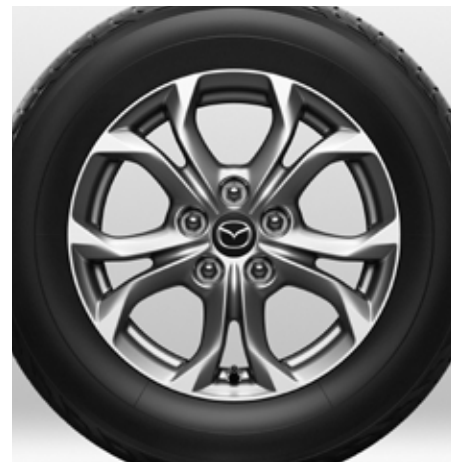
16-inch Alloy Wheel (GLX)