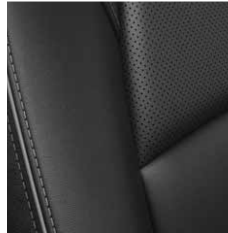
Black Leather# (GSX Leather, Limited)