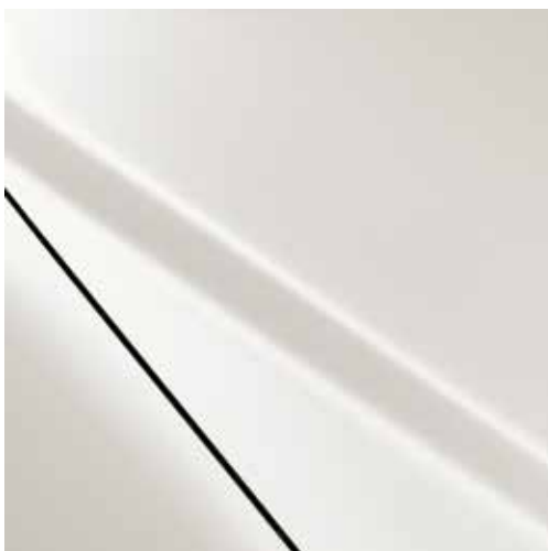
Snowflake White Pearl Mica