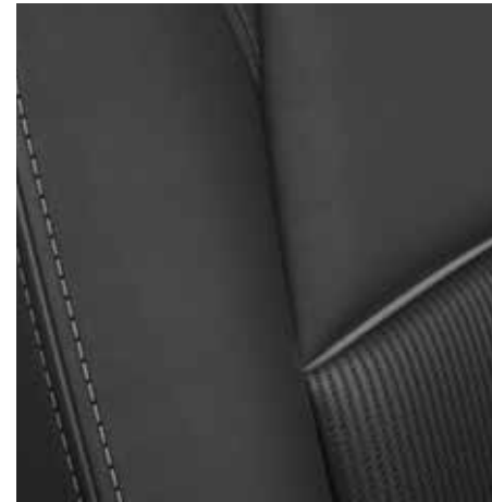
Black Deluxe Leatherette/Black Cloth (GSX)