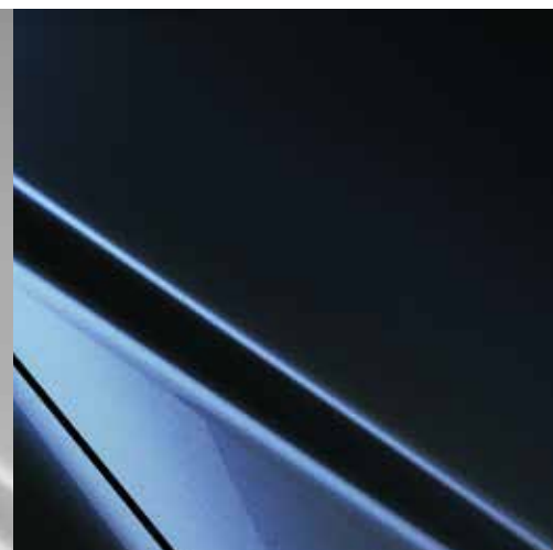
Deep Crystal Blue Mica