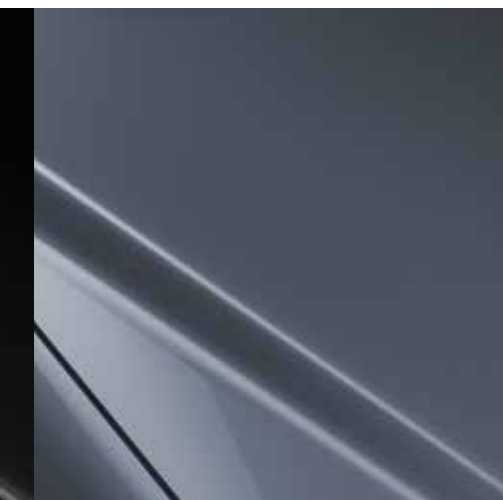
Polymetal Grey Metallic

# Leather interior includes some Maztex material on selected high impact surfaces. ^ Surcharge applies