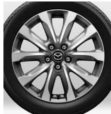
18-inch High-Gloss Alloy Wheel (Limited)