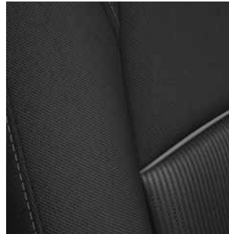
Black Cloth (GLX)