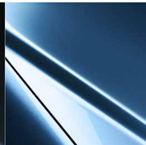
Eternal Blue Mica