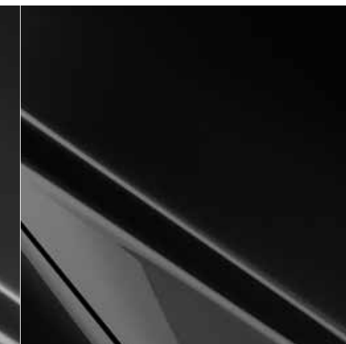
Jet Black Mica