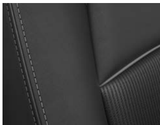
Leatherette / Cloth, Black GSX