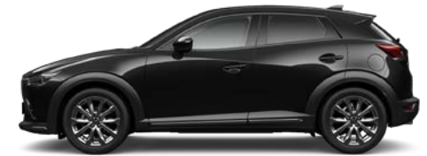
Jet Black Mica (41W)