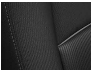
Cloth, Black GLX