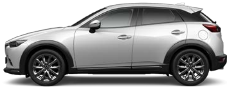
Ceramic Metallic (47A)