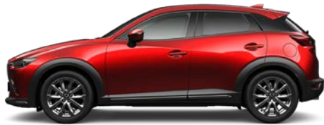
Soul Red Crystal Metallic (46V)