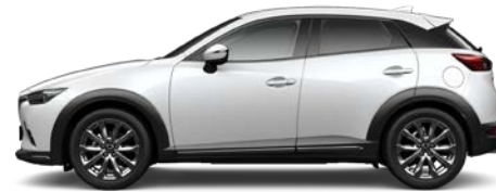
Snowflake White Pearl Mica (25D)