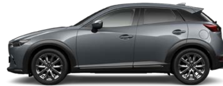
Polymetal Grey Metallic (47C)