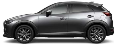
Machine Grey Metallic (46G)