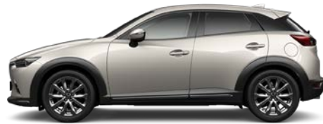
Platinum Quartz Metallic (47S)