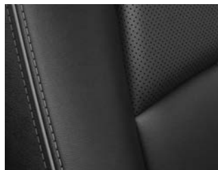
Leather, Black GSX Leather, Limited