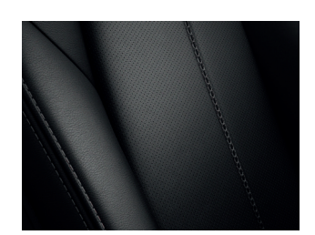
Leather, Black Roadster GT, RF Limited