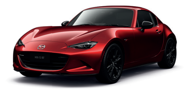
RF Limited SKYACTIV-G 2.0 Rear-Wheel Drive