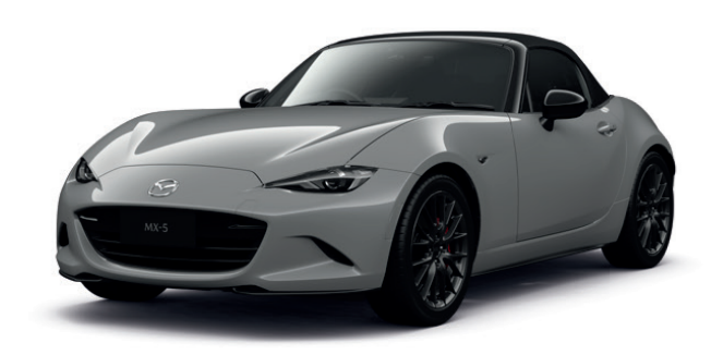
Roadster GT SKYACTIV-G 2.0 Rear-Wheel Drive