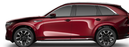
Artisan Red Metallic (51F)