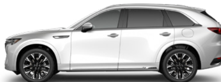
Rhodium White Metallic (51K)