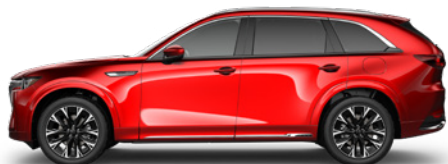
Soul Red Crystal Metallic (46V)