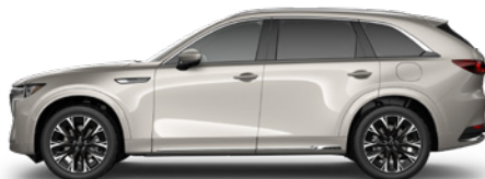
Platinum Quartz Metallic (47S)