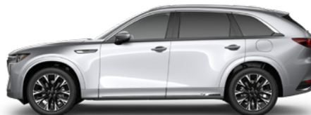
Sonic Silver Metallic (45P)