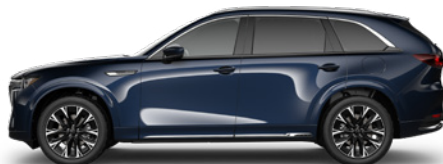
Deep Crystal Blue Mica (42M)