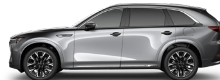
Machine Grey Metallic (46G)