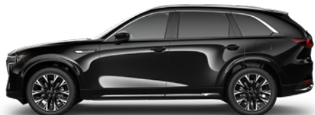
Jet Black Mica (41W)