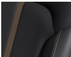
Nappa Leather, Black Takami