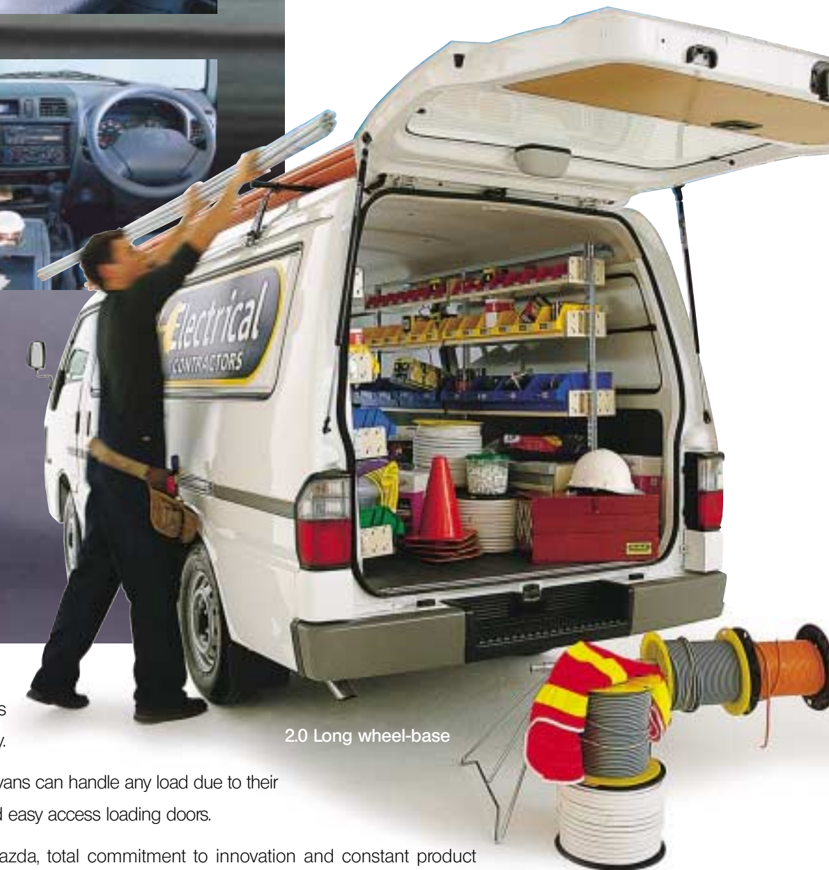
2.0 Long wheel-base