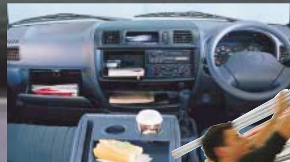
2.5D Long wheel-base