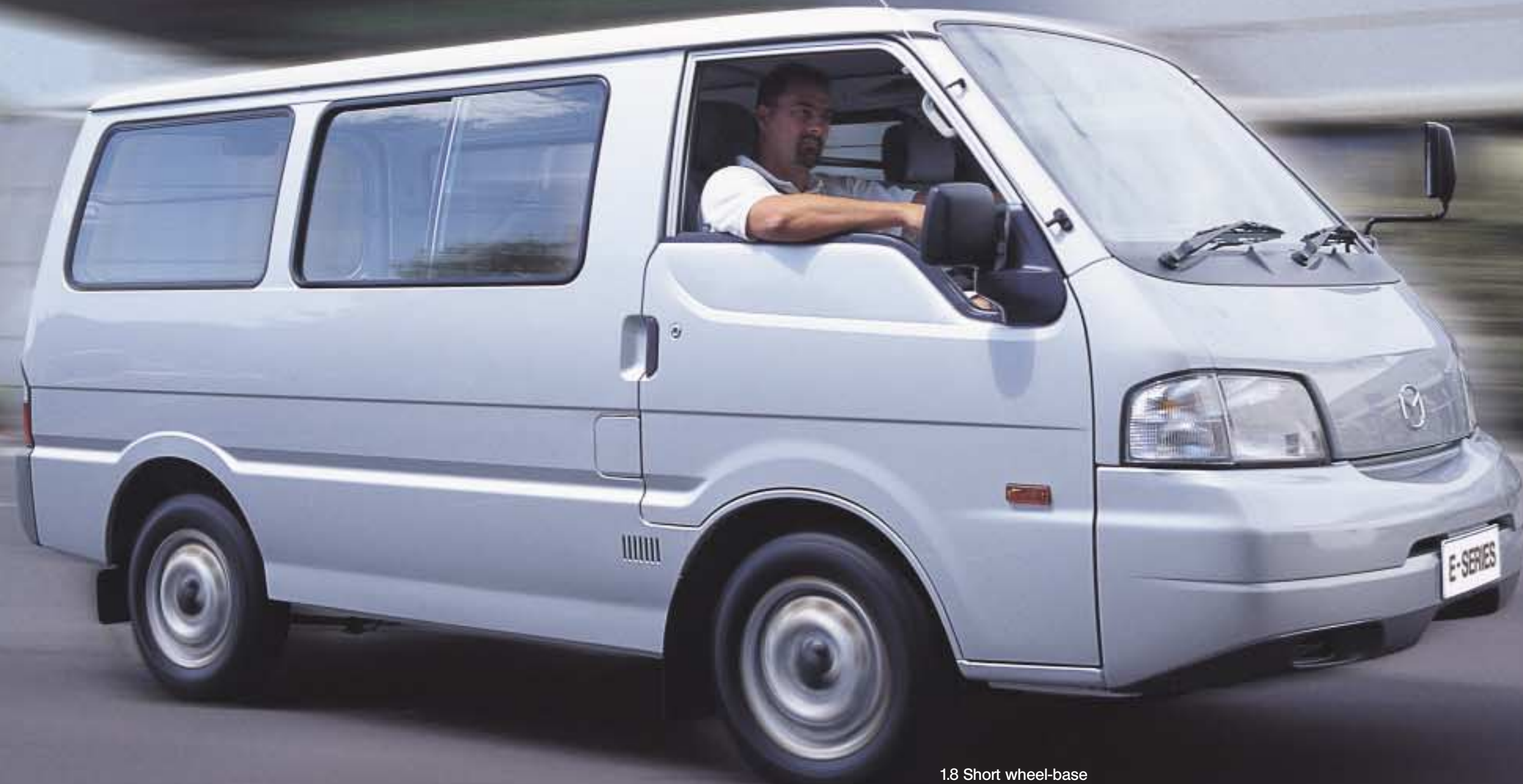
1.8 Short wheel-base

The E-Series vans from Mazda continue the company's tradition for design and engineering innovation. Constant development and improvement guarantee vehicles that will tackle the work asked of them.