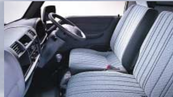
1.8 Short wheel-base and 2.0 Long wheel-base

layout provide a uniquely comfortable driving experience. With your safety in mind Mazda has incorporated improved visibility through a new low-cut window design, and wider repositioned door mirrors for rear visibility. All models feature an energy absorbing frame for increased protection in frontal collisions. This is built into the front bumper overhang and combined with side door impact beam and driver's air