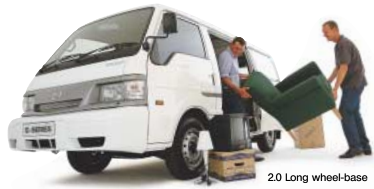
2.0 Long wheel-base